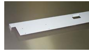
Figure 3 Top Jamb (1)