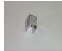
Figure 10 Optional Extender Clamp (6)