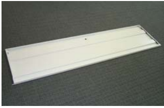
Figure 1 Left-Hand Door Panel (1) Right-Hand Door Panel (1) (Right Hand Door Depicted -- Note hole for handle)

The following parts are supplied for your door.