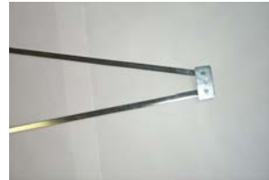
Figure 6 Lock Bar Assembly (1)