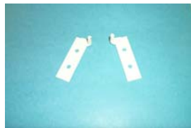
Figure 5 Pivot Pin Plates (2 Left-Hand, 2 Right-Hand)