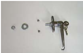
Figure 7 Handle with Key #10-32 X 3/16" screws (2) 3/8" flat washer (1) 3/8-16 lock nut (1)