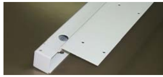
Figure 2 Bottom Jamb (1)