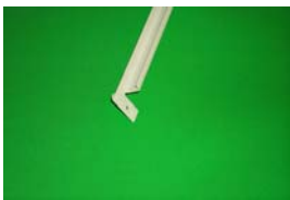
Figure 4 TS Shelf Supports (2) (Shipped in Separate Pack)