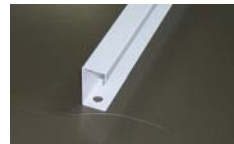
Figure 9 Optional Extender (2)