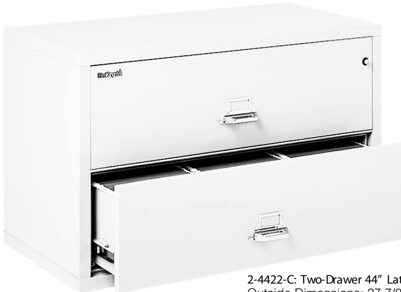
2-4422-C: Two-Drawer 44" Lateral File

Like all FireKing files, these carry FireKing's exclusive Lifetime Warranty on all parts. And our Free Replacement Guarantee: if your FireKing file ever has to protect your records in a fire and any damage occurs to its fire-protection abilities, we'll give you a new one free of charge.