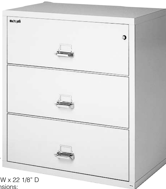
3-3822-C: Three-Drawer 38" Lateral File

Like all FireKing files, these carry FireKing's exclusive Lifetime Warranty on all parts. And our Free Replacement Guarantee: if your FireKing file ever has to protect your records in a fire and any damage occurs to its fire-protection abilities, we'll give you a new one free of charge.