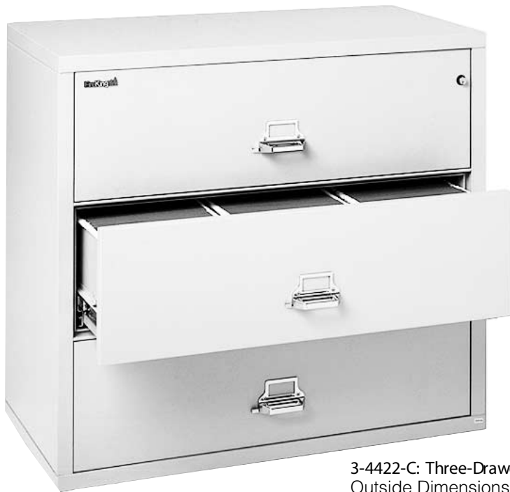
3-4422-C: Three-Drawer 44" Lateral File Outside Dimensions: 40 3/8" H x 44 27/64" W x 22 1/8" D Internal Drawer Dimensions: 10 3/8" H x 38 29/32" W x 15 1/4" D Approx. Shipping Weight: 869 lbs.

Like all FireKing files, these carry FireKing's exclusive Lifetime Warranty on all parts. And our Free Replacement Guarantee: if your FireKing file ever has to protect your records in a fire and any damage occurs to its fire-protection abilities, we'll give you a new one free of charge.