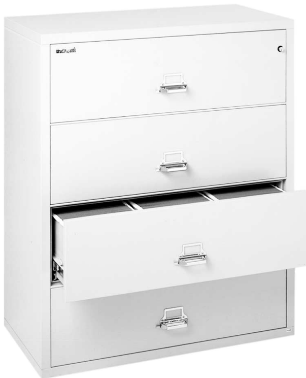
4-4422-C: Four-Drawer 44" Lateral File

Like all FireKing files, these carry FireKing's exclusive Lifetime Warranty on all parts. And our Free Replacement Guarantee: if your FireKing file ever has to protect your records in a fire and any damage occurs to its fire-protection abilities, we'll give you a new one free of charge.