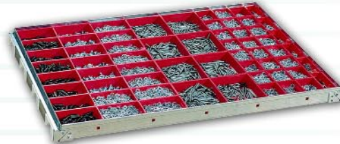
Trays with plastic boxes