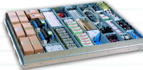
Trays with modular side-walls, partitions and dividers