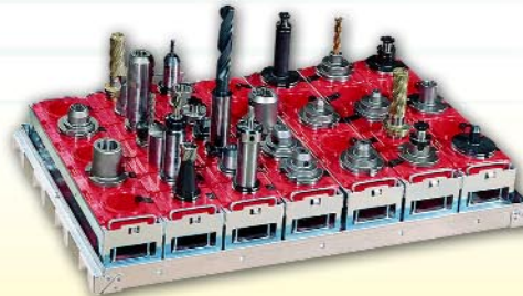
Trays with a tool holder system

All models can be customized to meet most any application. All specifications are nominal and subject to change without notice.